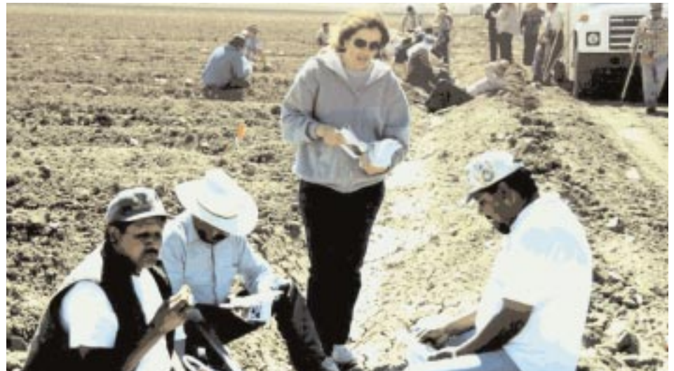
Promotora conducting outreach to farmworkers during a lunch break, near Somerton, AZ