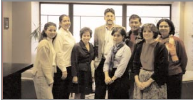
FJF Staff, October 2001