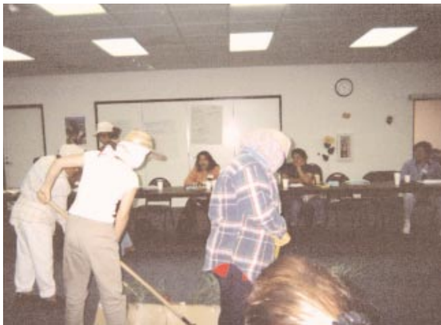
Promotores in Coachella, CA practicing a skit about pesticide safety at work

Assistance as staff attorney of the Indigenous Project, where she represented indigenous migrants from southern Mexico and Guatemala. ♦