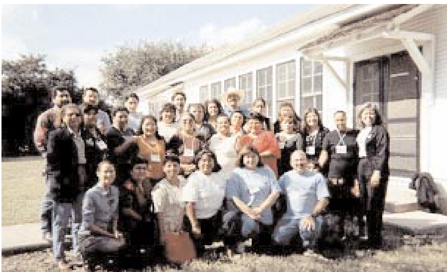
Promotores group, McAllen, Texas