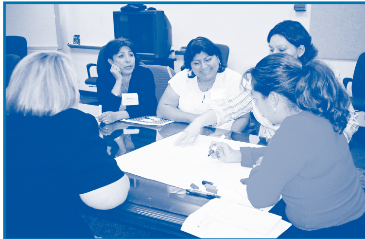
Conference participants discuss the effects of contaminated drinking water on their health

Co-sponsors of the event included the San Diego County Office of Border Health, Environmental Health Coalition, California Office of Environmental Health Hazard Assessment, The Community Health Worker Regional Development Center, Scripps Health/San Diego